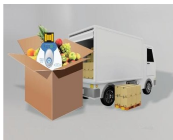
Put into the box / carton