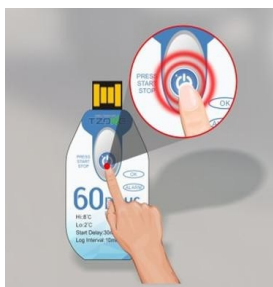
Press the button to start